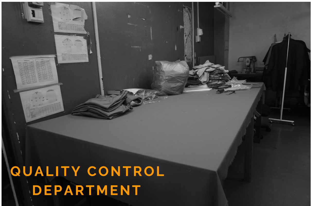
QUALITY CONTROL DEPARTMENT