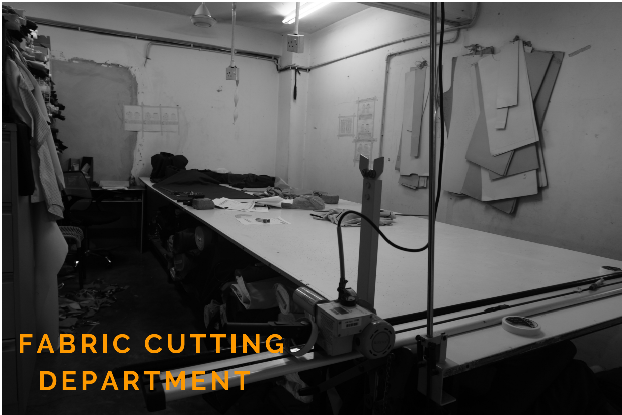
FABRIC CUTTING DEPARTMENT