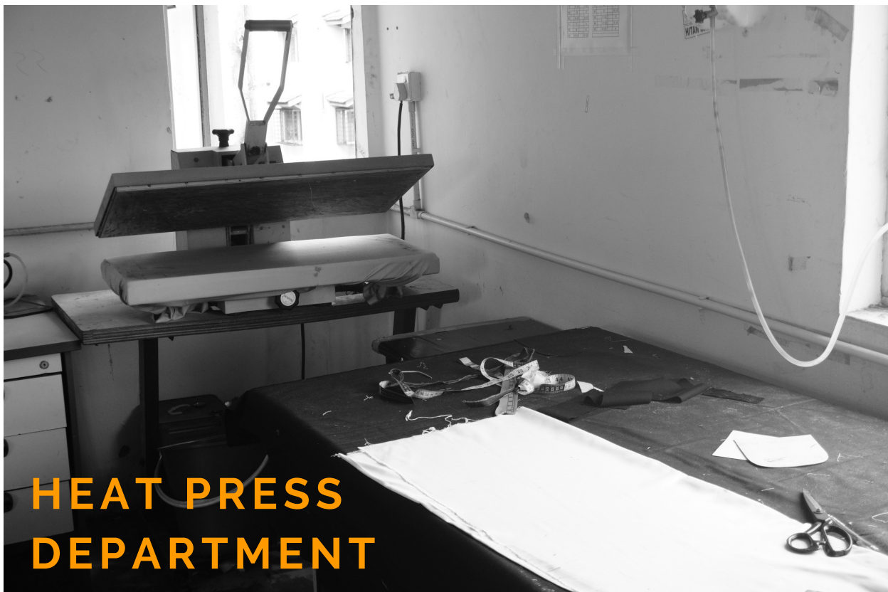
HEAT PRESS DEPARTMENT