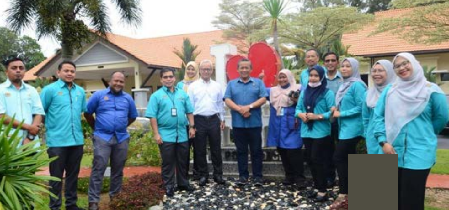
JABATAN PENGURUSAN HARTANAH