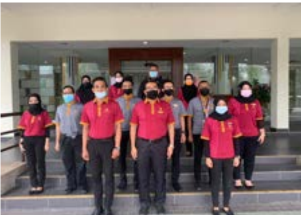
HOTEL SERI MALAYSIA