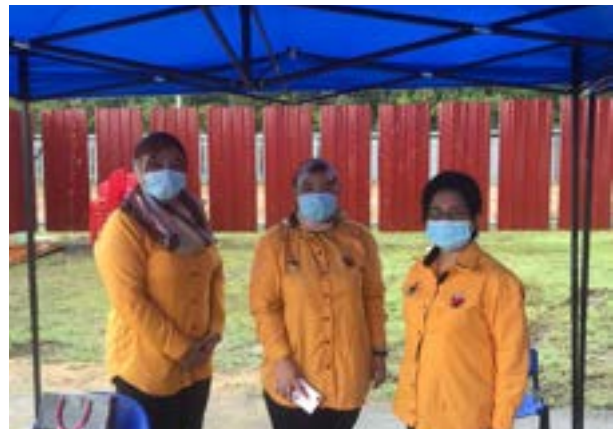
KOLEJ YAYASAN NEGERI SEMBILAN